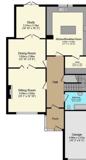
Ground Floor Floor area 106.6 sq.m. (1,148 sq.ft.)